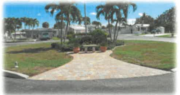
EAST END ROUNDABOUT